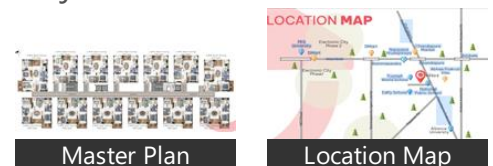
Master Plan Location Map