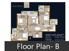
Floor Plan - B