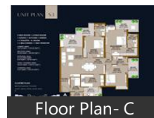
Floor Plan - C

* These floor plans are of the project and might not represent the property