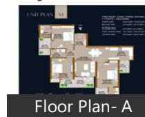
Floor Plan - A