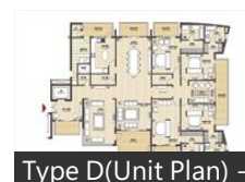
Type D(Unit Plan) -

* These floor plans are of the project and might not represent the property