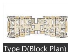
Type D(Block Plan) -