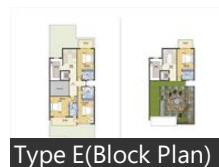
Type E(Block Plan) -