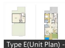
Type E(Unit Plan) -