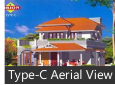
Type-C Aerial View