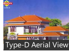
Type-D Aerial View