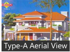
Type-A Aerial View