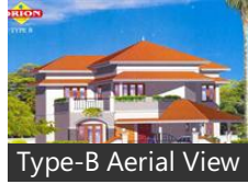
Type-B Aerial View