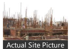
Actual Site Picture

* These pictures are of the project and might not represent the property