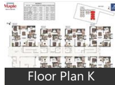
Floor Plan K