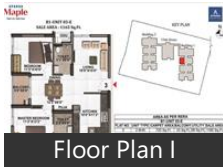
Floor Plan I