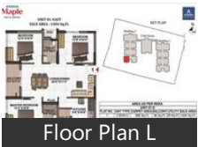
Floor Plan L