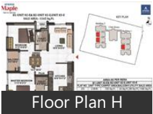
Floor Plan H