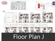
Floor Plan J