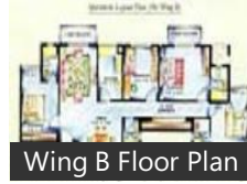
Wing B Floor Plan