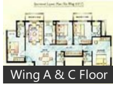
Wing A & C Floor