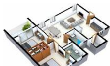
Floor plan D