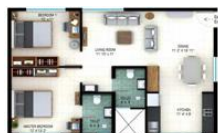
Floor plan B