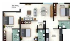
Floor plan C