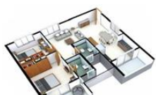
Floor Plan E