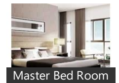
Master Bed Room

* These pictures are of the project and might not represent the property