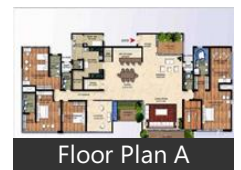
Floor Plan A