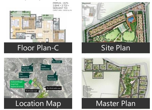
* These floor plans are of the project and might not represent the property