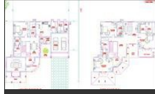
Villa Type-B1 Floor