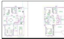
Villa Type-F1 Floor