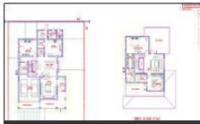
Villa Type-E1 Floor