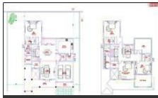
Villa Type-D1 Floor