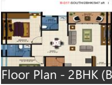
Floor Plan - 2BHK (B)