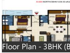
Floor Plan - 3BHK (B)