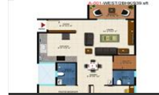
Floor Plan - 2BHK