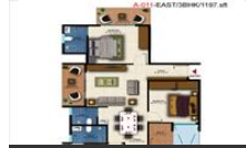
Floor Plan - 3BHK