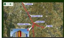
On Google Location