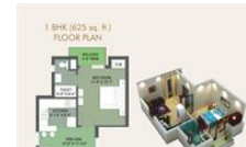
1 BHK - 625 Sq Ft