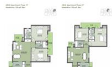
2 BHK - 1234 Sq Ft