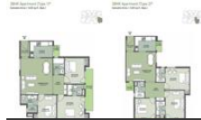
3 BHK - 1620 Sq Ft

* These floor plans are of the project and might not represent the property