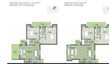
2 BHK - 1234 to