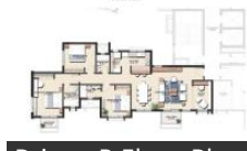
Primo-B Floor Plan