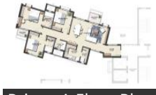
Primo-A Floor Plan