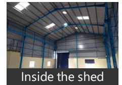
Inside the shed