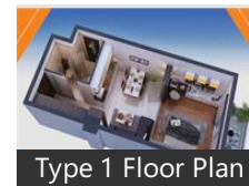
Type 1 Floor Plan