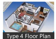
Type 4 Floor Plan