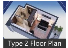
Type 2 Floor Plan