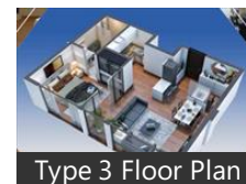
Type 3 Floor Plan