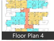
Floor Plan 4