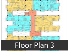
Floor Plan 3