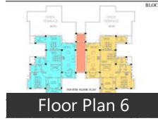
Floor Plan 6