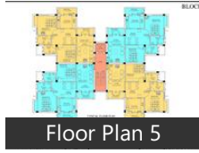
Floor Plan 5