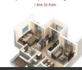
1Bhk -3D Layout

Posted: Dec 22, 2021 by Ramakrishnan Narayanan