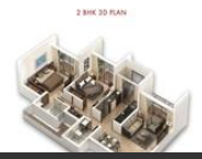
2Bhk -3D Layout

* These floor plans are of the project and might not represent the property