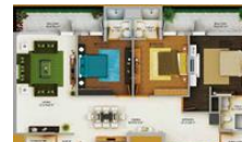
3BHK - Floor Plan -