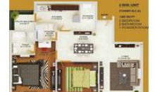
2BHK - Floor Plan