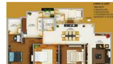
3BHK - Floor Plan -