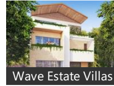
Wave Estate Villas