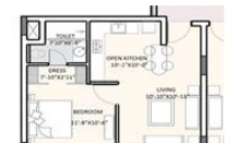
1BHK Layout Plan

* These floor plans are of the project and might not represent the property