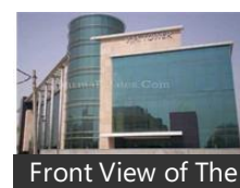
Front View of The