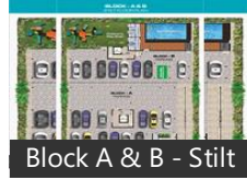
Block A & B - Stilt