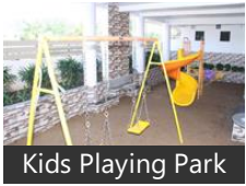
Kids Playing Park