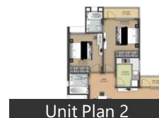
Unit Plan 2