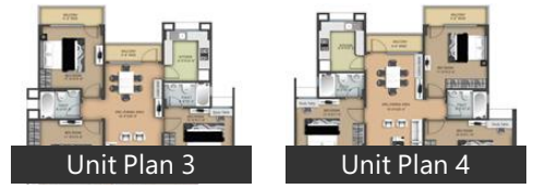
* These floor plans are of the project and might not represent the property

Disclaimer: The reviews are opinions of PropertyWala.com members, and not of PropertyWala.com.