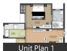
Unit Plan 1