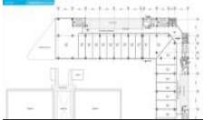
3rd Floor Plan