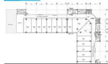
6th Floor Plan