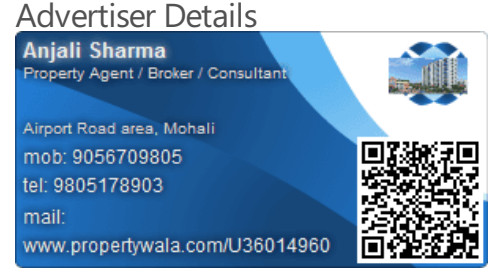
Scan QR code to get the contact info on your mobile