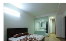
Master Bed Room