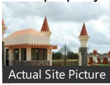
Actual Site Picture