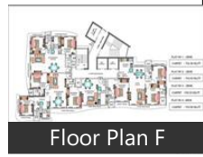
Floor Plan F