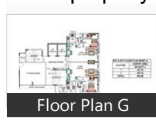
Floor Plan G