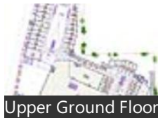
Upper Ground Floor