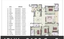
4BHK - 2100 Sq. Ft.