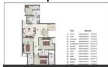
3 BHK - 1500 Sq. Ft.