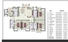
4BHK - 1950 Sq. Ft.