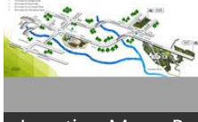
Location Map - B