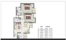
2 BHK - 1050 Sq. Ft.