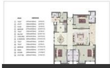
3 BHK - 1800 Sq. Ft.