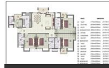
4BHK - 1980 Sq. Ft.