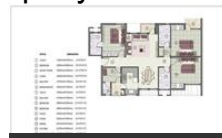
3 BHK - 1525 Sq. Ft.