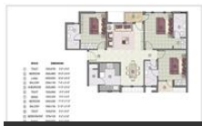
3 BHK - 1450 Sq. Ft.