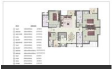
3 BHK - 1550 Sq. Ft.