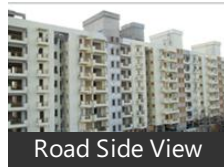
Road Side View