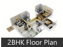
2BHK Floor Plan