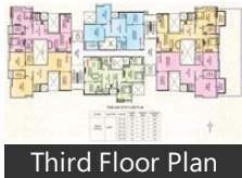
Third Floor Plan