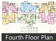
Fourth Floor Plan