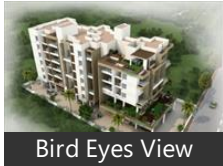
Bird Eyes View