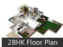
2BHK Floor Plan