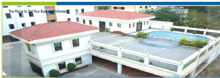
Oricon Rahul Residency