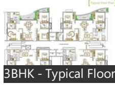
3BHK - Typical Floor