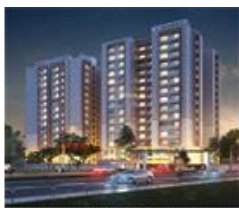
Shuvam AVENUE GHATIKIA