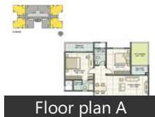
Floor plan A