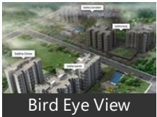
Bird Eye View