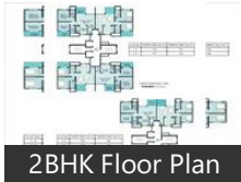
2BHK Floor Plan