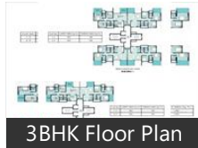
3BHK Floor Plan