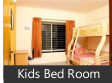
Kids Bed Room