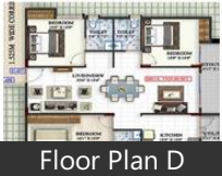
Floor Plan D