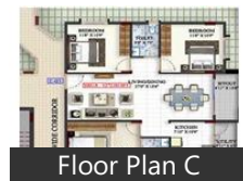
Floor Plan C