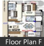
Floor Plan F