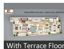
With Terrace Floor