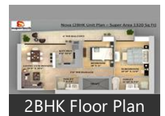
2BHK Floor Plan