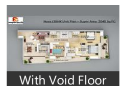
With Void Floor

* These floor plans are of the project and might not represent the property