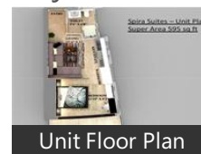
Unit Floor Plan