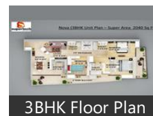
3BHK Floor Plan