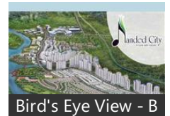
Bird's Eye View - B

* These pictures are of the project and might not represent the property