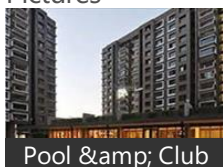
Pool & Club