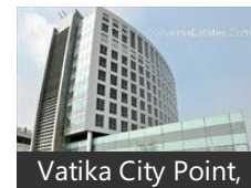
Vatika City Point,