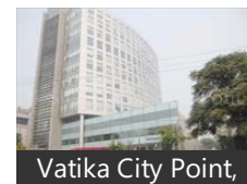
Vatika City Point,