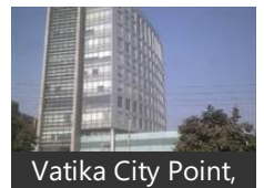
Vatika City Point,