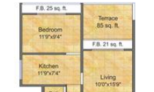
1BHK - Floor Plan