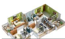
3D View - 3BHK