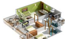
3D View - 2BHK