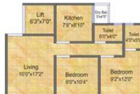
2BHK - Floor Plan