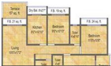
3BHK - Floor Plan