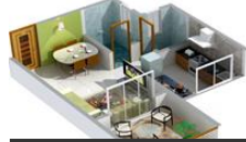
3D View - Studio