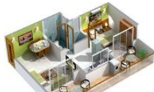
3D View - 1BHK