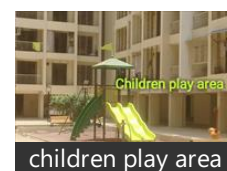
children play area