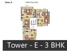
Tower - E - 3 BHK