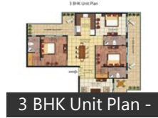
3 BHK Unit Plan -