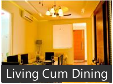
Living Cum Dining