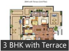
3 BHK with Terrace