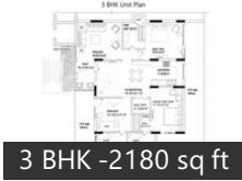
3 BHK - 2180 sq ft