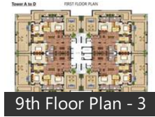
9th Floor Plan - 3