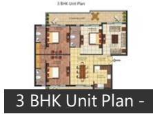
3 BHK Unit Plan -