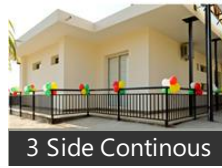
3 Side Continuous