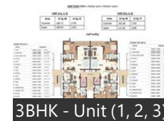
3BHK - Unit (1, 2, 3)