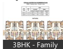
3BHK - Family