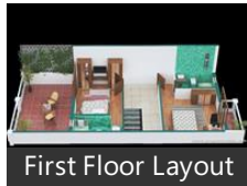
First Floor Layout