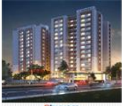
Shuvam AVENUE GHATIKIA