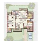
3BHK - Floor Plan

* These floor plans are of the project and might not represent the property