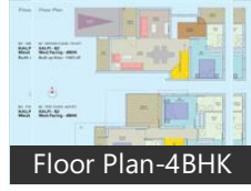
Floor Plan 4BHK