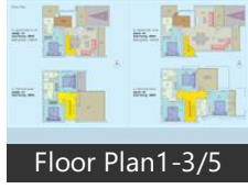
Floor Plan 1-3/5