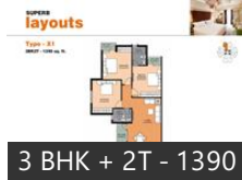
3 BHK + 2T - 1390