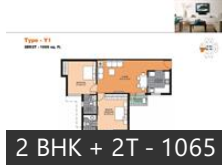
2 BHK + 2T - 1065